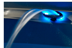
Water feature with adjustable flow and 9 LED color options