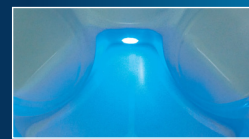
LED Footwell Light for an underwater glow