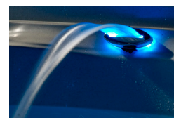
Water feature with adjustable flow and 9 LED color options